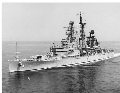
USS Little Rock CLG-4