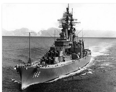
USS Newport News CA 148