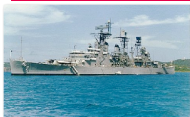
USS Springfield CLG-7