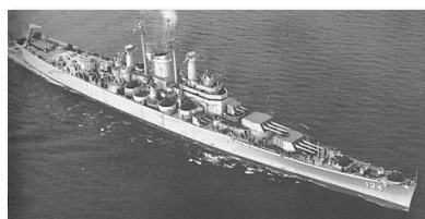
USS Des Moines CA-134