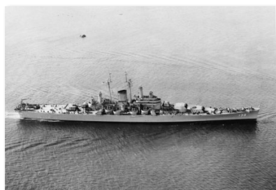
USS Salem CA-139