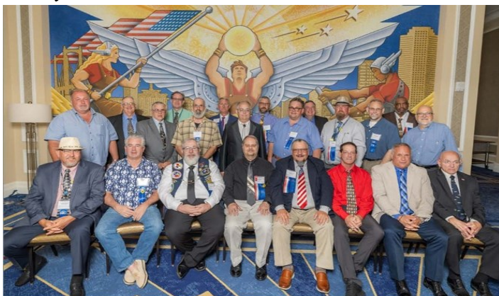
USS Boston SSN-703 SHIPMATES 2023 Reunion New Orleans